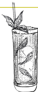
Nojito (Non-alc) Apple, Cold Press Ginger, Fresh Mint, Lime, Elderflower, Topped With Soda 8